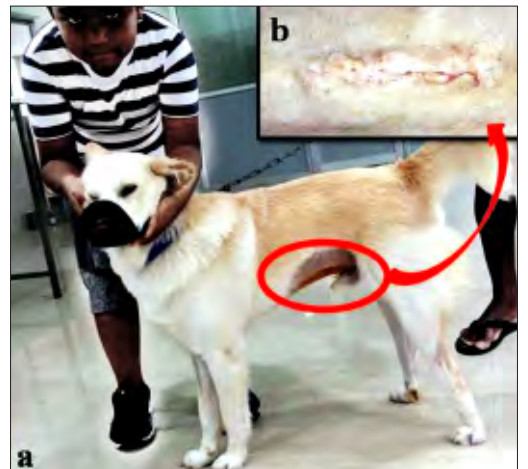
Fig. 4. a) The dog on 10^{th} day post surgery; b) operated site after suture removal showing complete healing

linea-alba, obstructed part of intestinal loops was exteriorized (Fig. 2). On the ante mesenteric end and distal segment of the obstruction, a linear incision was given to remove the foreign body which was found to be a stone (Fig. 3b). The enterotomy wound was closed by a unique pattern of suture technique. At first following normal saline irrigation mucosa, sub-mucosa and muscularis layer