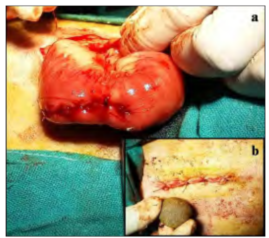
Fig. 3. a) Cushing suture placed over serosal layer; b) closure of laparotomy wound & the recovered stone