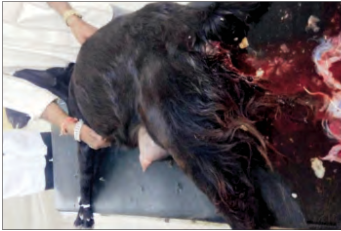
Fig. 1. Beetal doe in right lateral position at the examination table

can be grouped into two categories i.e., visceral presentation in which fetal viscera are lying in the birth canal or protruding from the vulva and extremities presentation in which all four limbs or either of two limbs are present in the birth canal. Most of the literature concerning Schistosomus reflexus in cattle revealed extremities presentation (Kalita et al. , 2004; Sharma et al. , 2017). However, in the present case, the visceral organs along with the water bag protruding from the vulva confirmed the visceral presentation (Yadav et al. , 2017). The right cause of these teratological defects is still not known but the preliminary analysis of associated etiology may inform that Schistosomus reflexus has a genetic etiology. Murine gene mutations producing severe ventral body wall defects associated with anomalies of internal organs and other structures have been implicated in causing this condition (Laughton et al. , 2005). The condition is common in cattle and buffaloes (Srivastava et al. , 1998; Kumar et al. , 2016b; Dutt et al. , 2019) and can be corrected either by fetotomy or caesarean section and if the fetus is smaller than normal size and fully relaxed cervix then it can be delivered manually (Periyannan et al. , 2022).