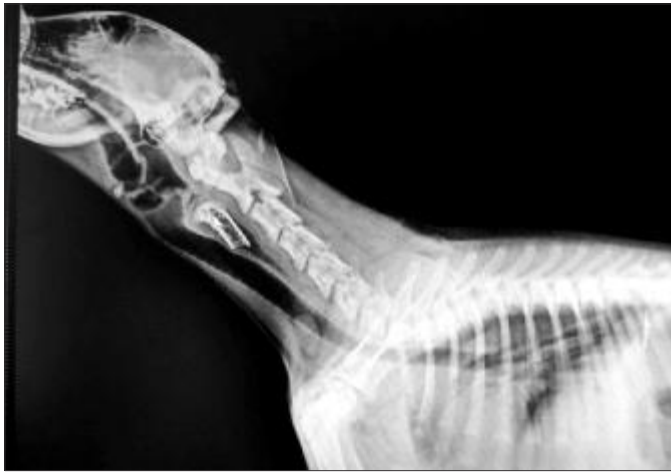
Fig. 1. Radiograph of neck lateral view - Foreign body (bone)