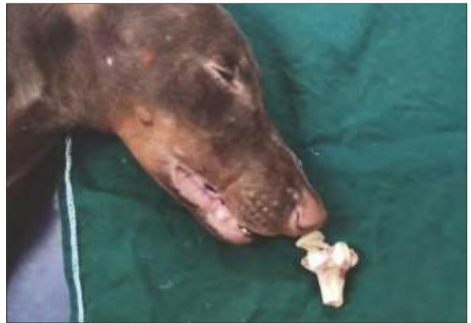
Fig. 4. Retrieved foreign body- Chicken bone

dynamic real time image helps to locate and retrieve the foreign body easily in this case and the same technique was suggested by Moore (2001) in which the removal was rapid and effective with no complications in dogs. Lodgment of objects in the esophagus can result in complications such as ulceration and esophagitis, esophageal perforation, pneumothorax, pneumomediastinum and aortic perforation (Ryan and Greene, 1975). None of the complications was encountered in present case and the animal returns to normalcy on the next day. This could be due to early presentation and non-invasive retrieval of foreign body.