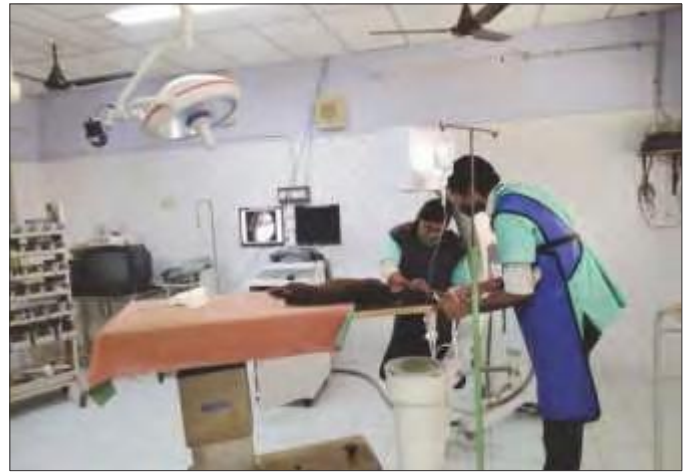
Fig. 2. Animal placed under C-arm guidance