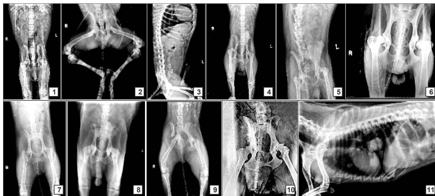
Fig. 1-11. (1) X-ray Pelvis Ventrodorsal; (2) X-ray-Pelvis-ventrodorsal-frog leg view; (3) X-ray-Pelvis-lateral view; (4) Right craniodorsal hip dislocation; (5) Osteoarthritic changes noticed in left hip; (6) Osteophyte formation in acetabular rim in right hip; (7) Left acetabular rim fracture; (8) Bilateral stable femur head Fracture; (9) Fracture of right ilium, pubis, acetabulum and distal femur; (10) Sun burst appearance of right ilium and acetabulum; (11) Metastatic lesion in lung parenchyma

Among the breeds, incidence of hip dysplasia was found to be high in German Shepherd (41.17%) followed by Labrador (23.52%). This is in accordance with findings of (Leppanen et al. , 2000) who stated that the prevalence varies by breeds and breed groups, but is common in German Shepherds with a reported 37% incidence. This may be due to heredity and lack of awareness among